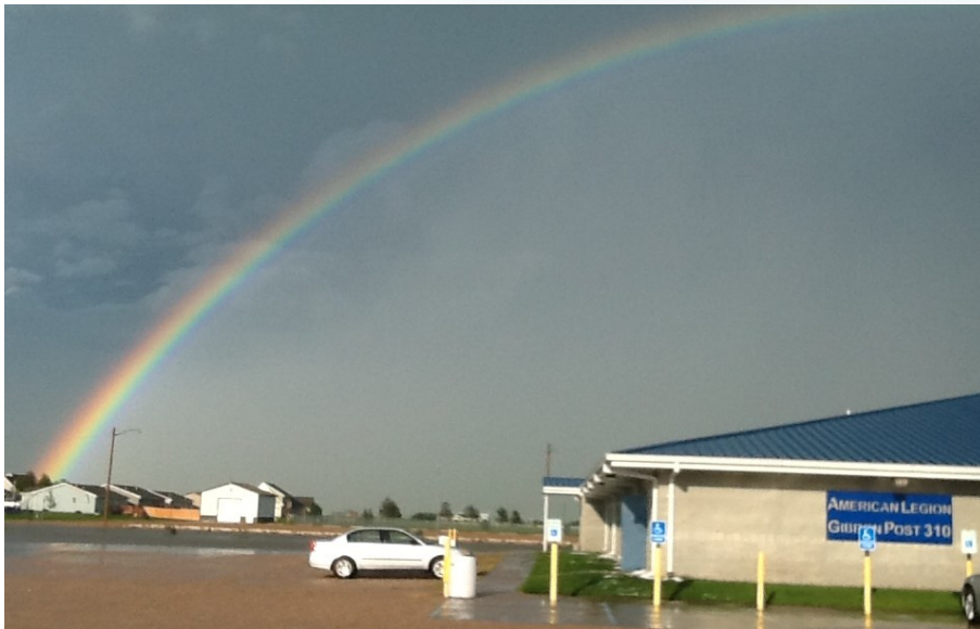
Ryan Brehmer took this picture of a rainbow shining over the Gibbon Legion Post #310 building after the storm passed on July 13.