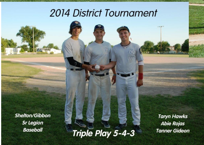
Shelton/Gibbon Sr Legion Baseball